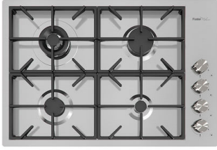
Cooker hob Foster Milano 7637 000