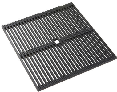
Black grid 8100 600