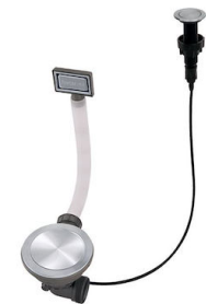
Space Push automatic waste fitting - PP 8407 116